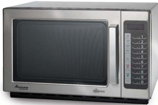
Model RCS10TS shown